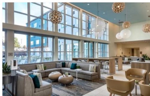
Element Hotel, Downtown, Bend, Oregon includes hot breakfast daily. Indoor pool, hot tub, and indoor gym.

Qualifying ages: Adult 18-64 yrs.; Senior 65-69 yrs.; Super Seniors 70+; Child 6-12; Youth 13-18